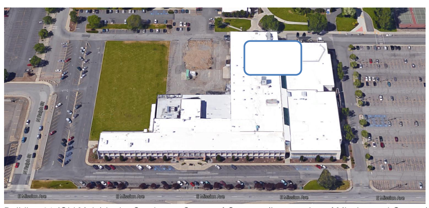
Building 01 (Old Main) in the Southwest Corner of Campus (Intersection of Mission and Greene) (Blue Rectangle locates the CAD & Mechanical Program area) (Visitor Parking and Parking Meters available along the front of the building)