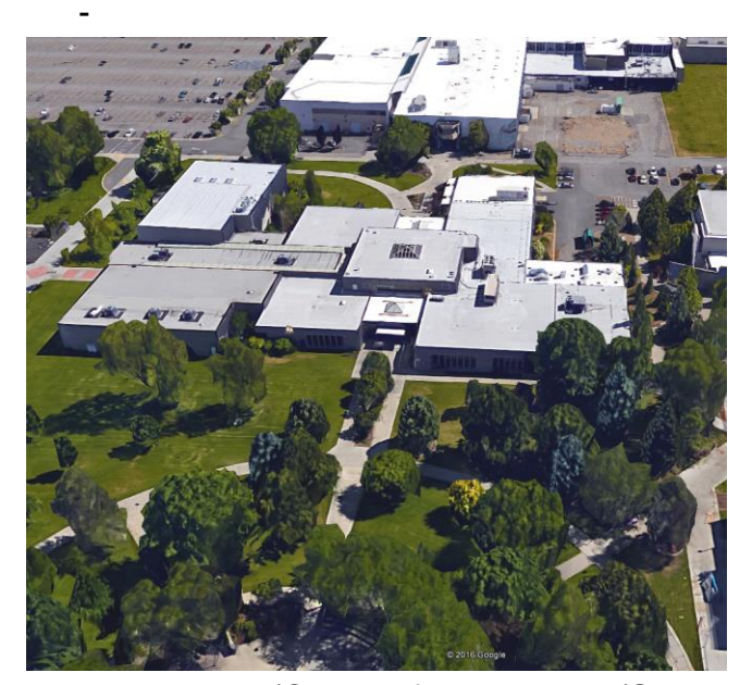
From the North (Coming from the Lair (Student Union Center) or Registration Building

- Take the hallway with a slight jog to the left, then turn Right (North).