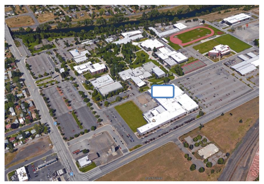
SCC Campus on the Corner of Mission Ave and Greene Street (Blue rectangle locates the CAD & Mechanical Program area)