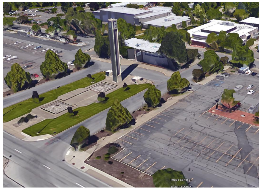
Main Campus Entrance – West Side (along Greene St.) by the Clock Tower (Takes you to the Registration and Counseling offices in Building 15) (Parking meters are available in this area)